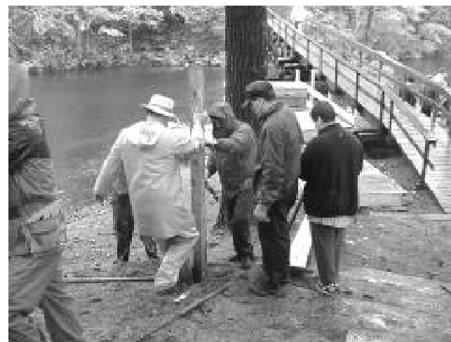
The Wet Look.... Candidates at Camp Hinds work through the soggy conditions while placing a new fencepost on the stairs near Tenney Bridge.