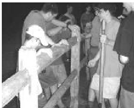
Hold it Up! Brothers at Camp Bomazeen during Week II help to re-install the fencing around the archery area during the OA Service Hour.

For the third year, the OA Service Hour took place at both summer camps and assisted both camps in continued maintenance and repair in a variety of work projects. Every Wednesday at Bomazeen, and Thursday at Hinds, members of our lodge, and any visiting lodges who attended camp could work for approximately one hour to help camp rangers with various projects. In return for this cheerful service, each participants receives a service hour patch, fellowship, and an ice-cream social for their efforts. Some of the projects completed during the “Summer of Service” included the repair of campsite fire ring seating at Camp Hinds, continued work on the biking trail, and general maintenance, while at Camp Bomazeen, Scouts see Summer of Service.... page 3