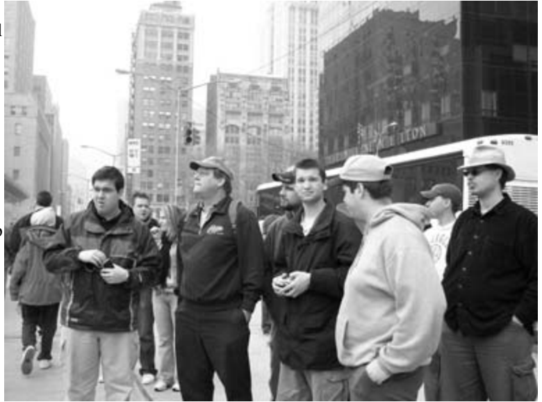
New York...Skyscrapers and everything: Madockawanda leadership lands in NYC during their recent trip to the National Leadership Seminar.

We hit the big city early and went to Ground Zero. It is still a sad place as I am sure it will be for many years to come. We then went to the Grand Central Station, The Empire State Building, to the Council office there and last but not least Times Square. Then headed off to camp to start training. Once we got to camp all the weather did was rain. The training start Friday night, with introductions and over look at the weekend, NLS is put on by the region and is run by the region chief and the instructors are Section chiefs, National Officers and Advisers. The training covers what kind of