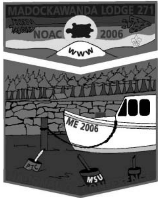
Not the Jamboree patch! We don't have that one yet, but this is a "keepa" as well...the 2006 NOAC Contingent Flap!