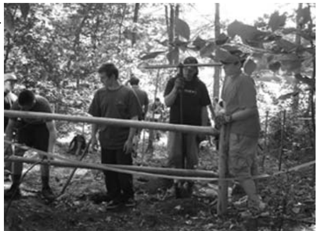
Members Ponder the Meditation Area: A clan of Ordeal candidates help install the new fencing which outlines the entrance to the Meditation Area just off the banks of the Tenny River. The project will be completed during the Spring Ordeal in 2006

The 2005 Fall Ordeal at Camp Hinds proved to be as productive this year as in years past. Arrowmen worked hard to complete many projects to finish winterizing camp and to prepare it for the next season. As always, classic projects such as the removal of the "Green Roof" on the dining hall and brush cleanup finalized the closing of camp, with some of the regulars participating. As with any Order of the Arrow event, there was the necessary fire. A crew successfully burned the Patrick campsite lean-to and the old boating area rowboat docks. On a more constructive note, the Tenny shower house was given another coat of stain, the Scoutcraft storage trailer was given a coat of paint, and Casco Bay chapter began construction of a new lean-to at Patrick. The focus of the weekend was on the newly created meditation area behind Patrick campsite. Most of the weekend work force was directed to complete this large project. It now adds a nice place to sit and face a scenic portion of the majestic Tenny River. Members of the lodge came together for a fun weekend with a little blood, the usual surplus of sweat, and probably a few tears to give the service that the order is founded on, making the Ordeal something of a success. ■