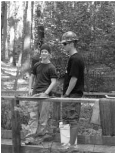
Boys in the Wood: Brothers who will remain nameless stand patiently at Camp Bomazeen during the Fall 2006 Ordeal.