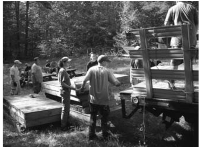
Carrying the Load: Brothers help load the old tent platforms onto the panel truck as they are brought to the fire pit for final destruction.