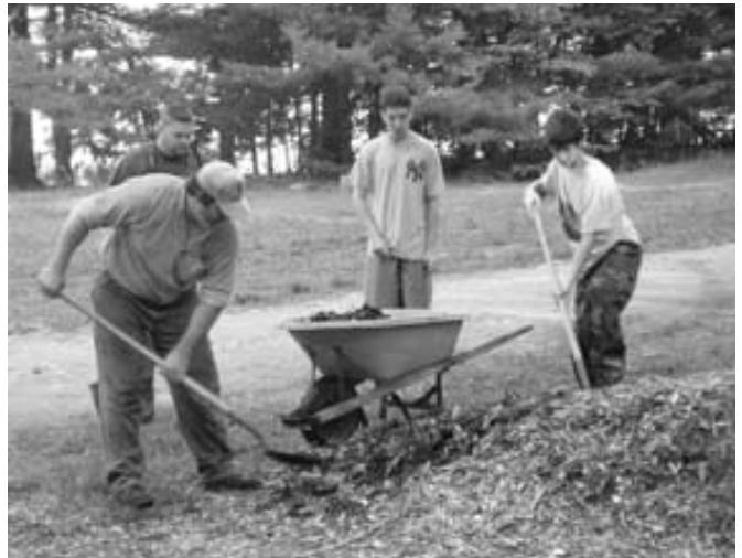
Filling the Need: A few candidates help move bark mulch near McCurdy Cabin at the Fall Ordeal held at Camp Bomazeen.