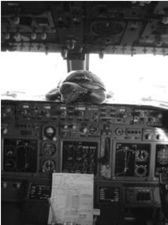
Oh at the Stick: Our Lodge Mascot, Oh, poses in the cockpit of our US Air flight from Manchester to Chicago on the first leg of his NOAC Tour. See more of Oh's adventures at the LLD and Banquet!