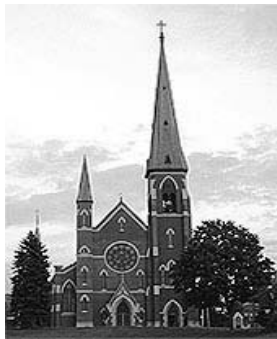
Banquet: A great shot of the Church of the Immaculate Conception in Portland, the site of our 2006 Annual Family Banquet.

I'm assuming that all of you have been to a banquet before, regardless of the reason or event. Well, unless it was the Annual OA Banquet than you ain't seen nothing yet! So, what does the banquet offer to a brother interested in attending? Well, first of all this is one of our events that family is more than welcome to attend, and in fact we encourage guests since they get to see what our lodge does over the past year. So, what else you may ask? Well, we have a guest speaker that usually covers a topic of local or national interest, either from the Scouting or Order, or possibly even from the local community. We also have reports from our committees and chapters, and present the Founders' Awards, Honor Chapter, and other awards up the Wazzzooo. The food is great and the fellowship of the Lodge is even greater. The Lodge store will also be there for your last minute Christmas items and it is also a prime time to pay your dues for 2007, so don't forget to attend and register when the flyer is mailed in November. This year we are shooting for the largest banquet and without you that is not possible.